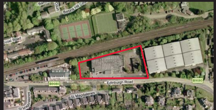
Site Boundary - For indicative purposes only

The site is prominently located on the B9080 Edinburgh Road which is the main arterial road connecting the south east of Linlithgow to the town centre. It is approximately 500 yards from the eastern edge of the High Street and is located in close proximity to the main train station, station car park and a Tesco supermarket.